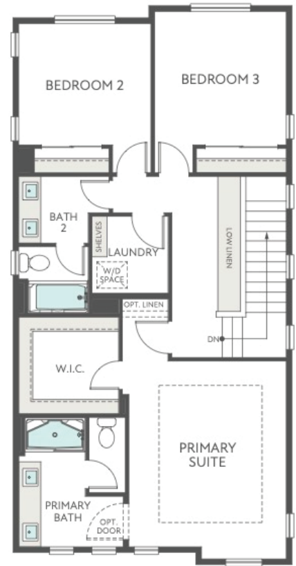
THIRD FLOOR EXTERIOR STYLE A