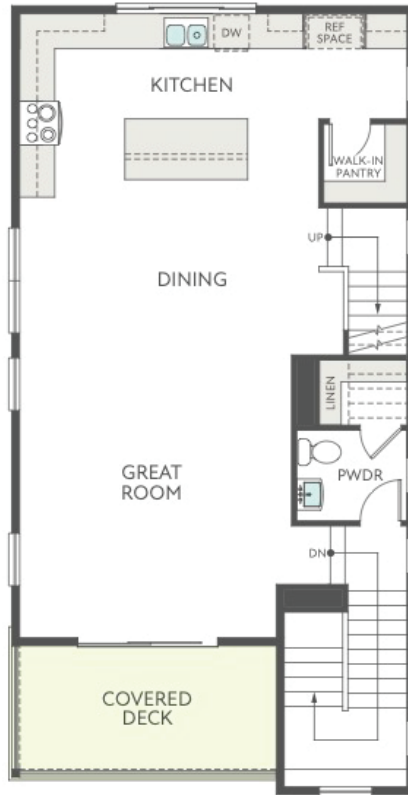
SECOND FLOOR EXTERIOR STYLE A