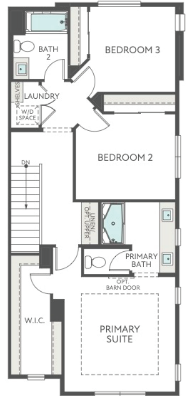
THIRD FLOOR EXTERIOR STYLE A