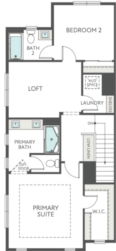
THIRD FLOOR EXTERIOR STYLE A